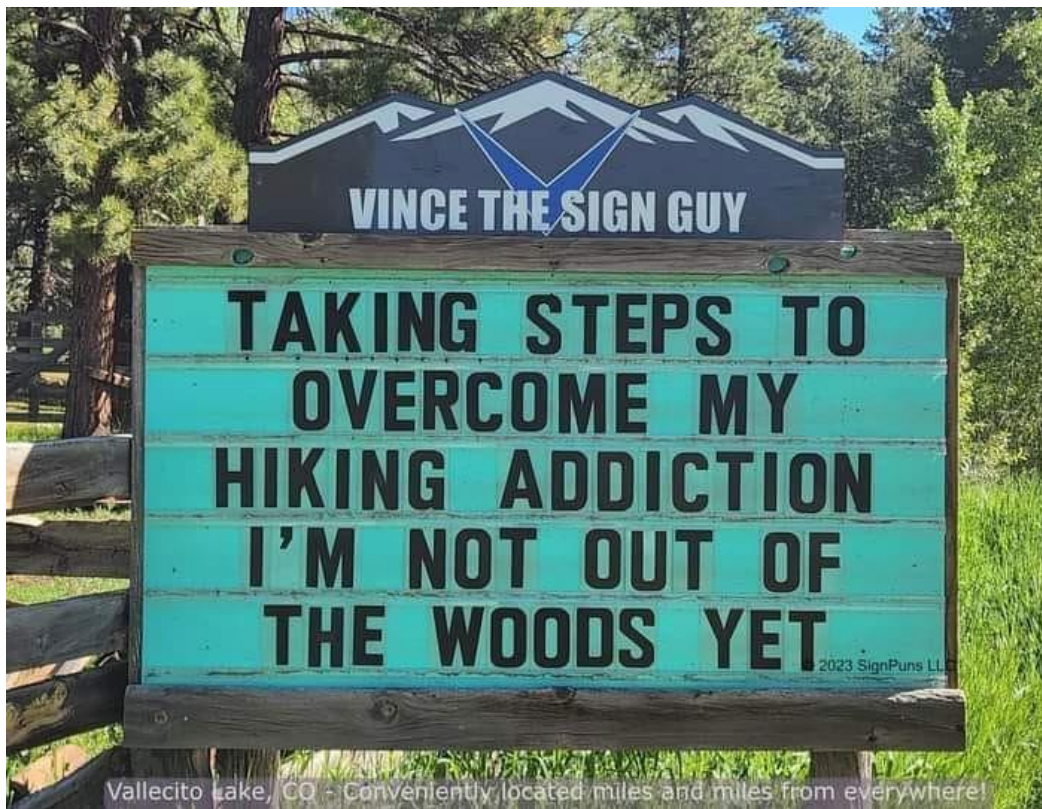
Vallecito Lake, CO - Conveniently located miles and miles from everywhere!